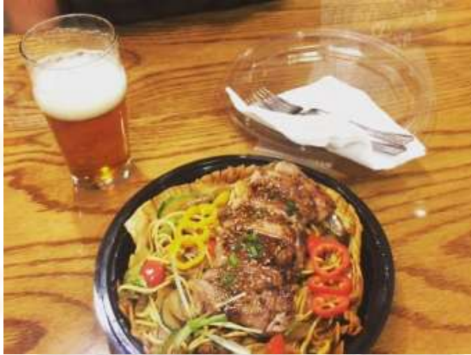
Strip Steak Lo Mein Noodle and Veggie Bowl